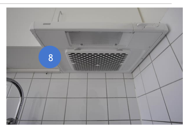
8. Change the filter in your kitchen fan. A new one can be picked up in the customer service office. If you live at Kemivägen 7A or 7B, you have a special filter in your kitchen fan which is made out of metal. You only need to clean it with water and detergent.