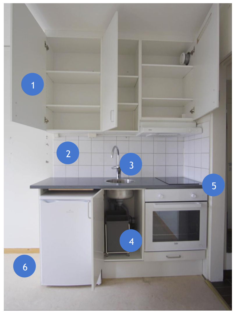
1. Wash the kitchen drawers inside and outside, underneath and on top. Do not forget the handles and the cabinet doors!