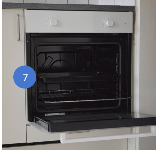
7. Clean the oven, please do not forget the inside and outside of the oven door, the oven handle and pull out the knobs for oven temperature and settings